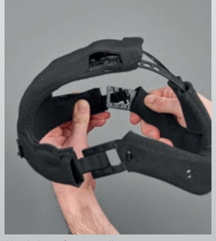
Head circumference adjustment