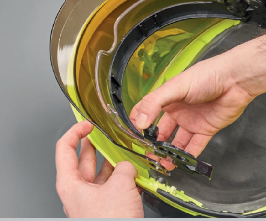
Attaching the visors

With the HEROS H30 and HEROS Titan, both maintenance and parts replacement take hardly any time. With only 10 components, the helmet's interior fittings can be maintained, washed, or replaced quickly. The individual textile components can be removed without special tools. Of course, the entire helmet is also washable; a special wash bag is available for this purpose.