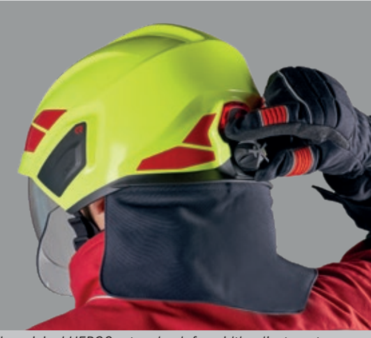
The original HEROS rotary knob for width adjustment