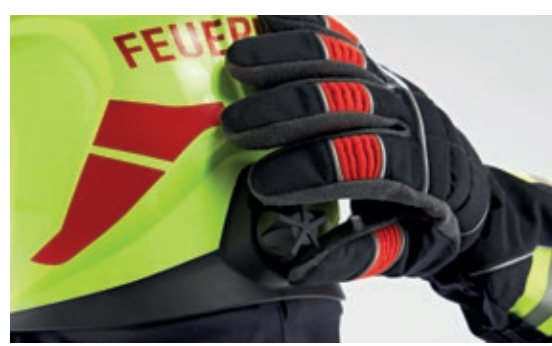
Width adjustment with the original HEROS rotary knob.

Low weight. Precise fit. Ease of service. Thanks to their low weight and sophisticated adjustment system, the Rosenbauer HEROS Titan and HEROS H30 firefighting helmets ensure a perfect fit and this means maximum safety as well as outstanding wearing comfort. Added to this is the high level of convenience when cleaning and replacing parts.