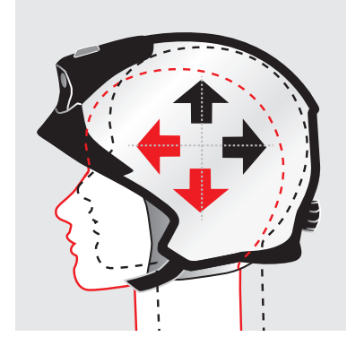
Easy to adjust on all axes.

In addition to the size of the helmet inside, the center of gravity and the distance to the visor can also be adjusted. The positioning of the helmet's center of gravity on the longitudinal axis of the body keeps the head in balance. This increases the wearing comfort enormously and makes the firefighter almost forget that they are wearing a helmet.