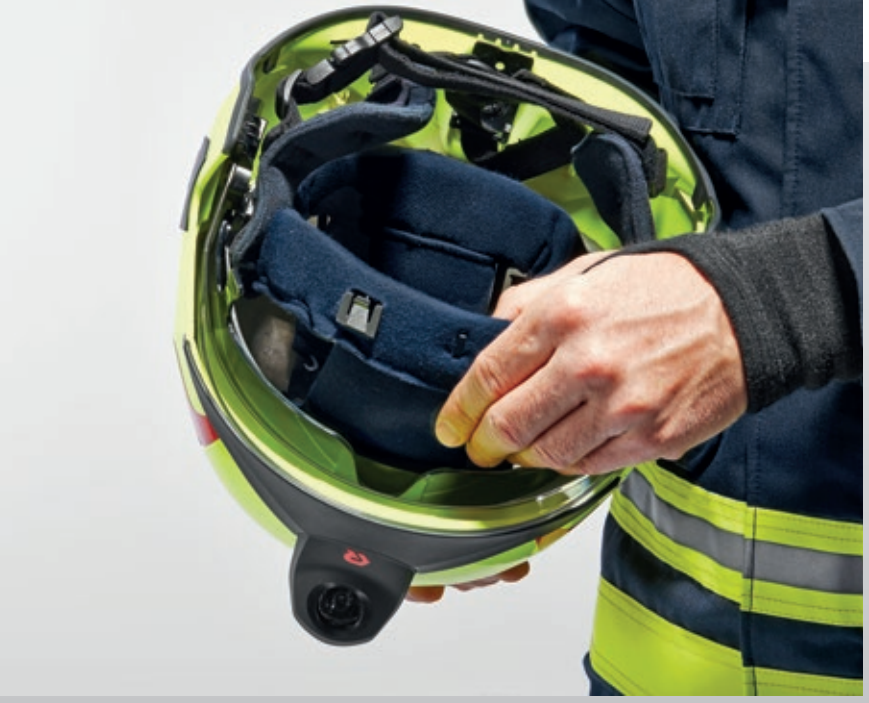
Assembly of the interior fittings without tools.

Maintenance and replacement of elements takes very little time with HEROS Titan and HEROS H30. With only 10 components, handling, washing or changing the internal fittings of the firefighting helmet can be done quickly. No tools are needed to dismantle individual textile components. Of course, the complete helmet is also washable; a special wash bag is available for this purpose.