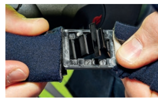
Setting the head circumference.