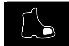
NON METALIC TOECAP