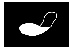
FLEXIBLE ANTI-PUNCTURE INSOLE