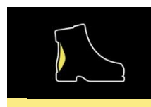
3M® REFLECTIVE STRIPS