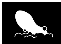
WASHABLE REMOVABLE INSOLES