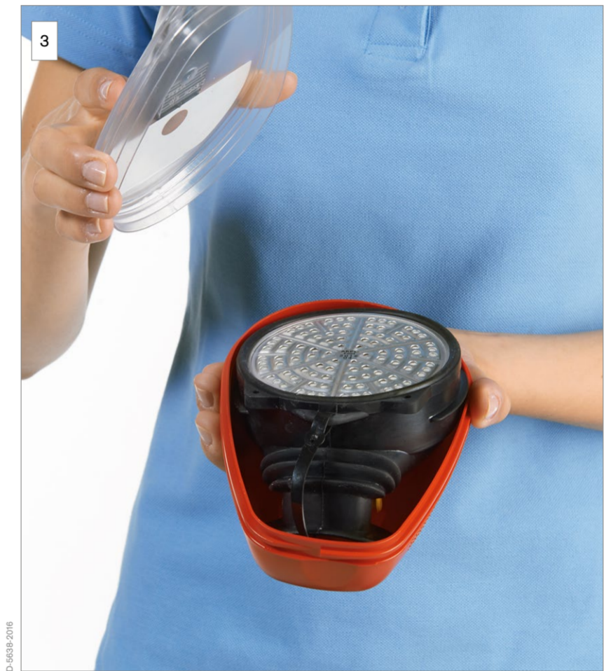
3 Open the case.