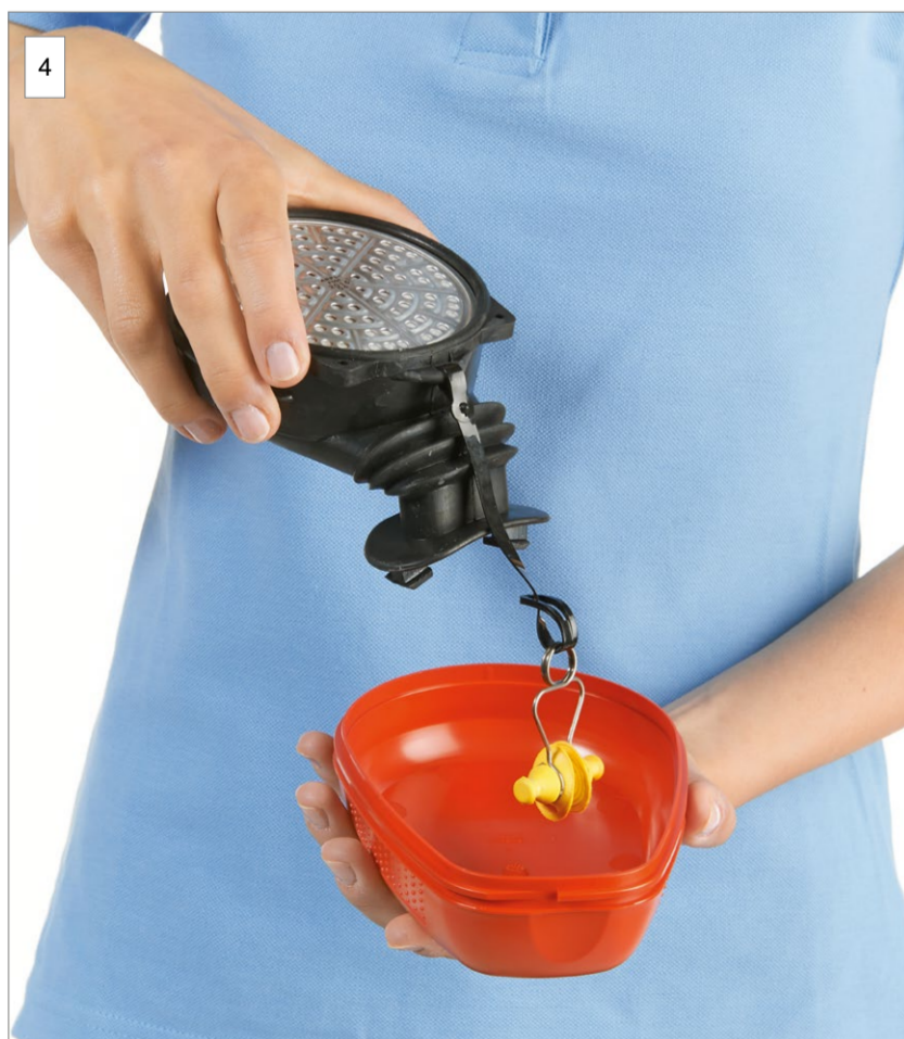
4 Remove the unit.