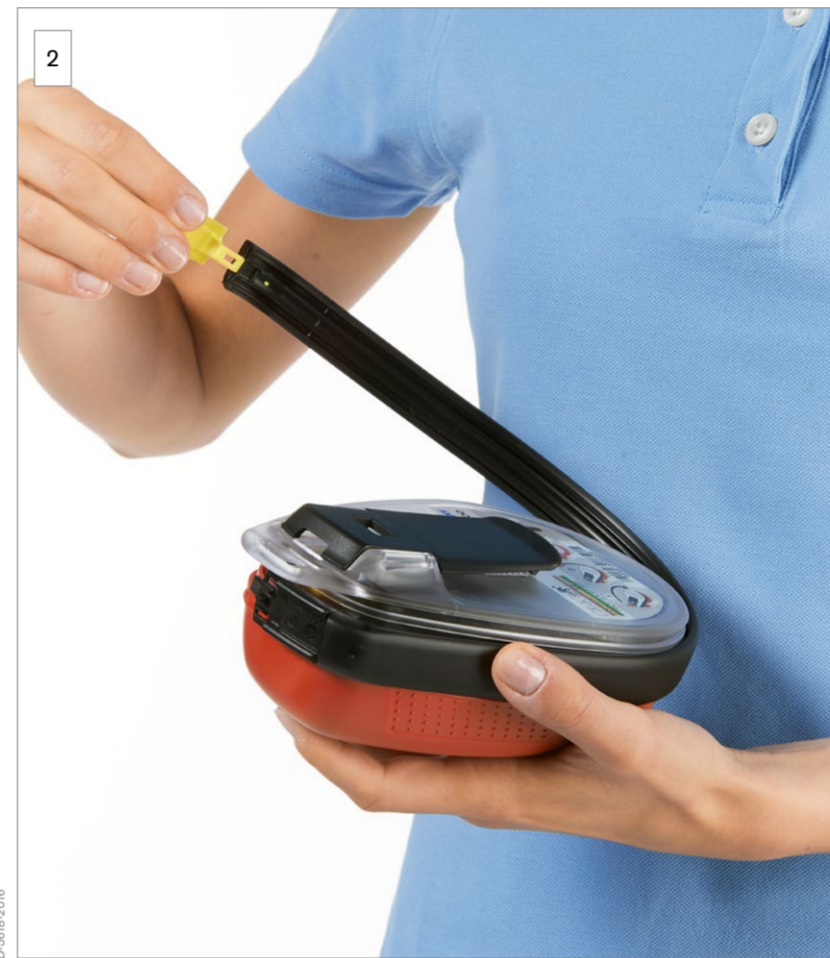
2 Remove the sealing band.