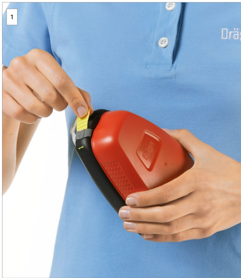
1 Grab the tab and pull.